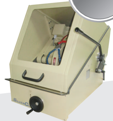
VN-300 series Table cut-off machines

For more than 40 years SilverCut is a reliable partner in the field of cutting technology. In Mosbach special and production machines are developed and built for the assembly of guides, tubes, spindles, implants, etc. as well as special machines for test cuts and metallography.