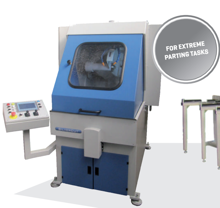
CN-432 series Partial or fully automatic parting system for wet cut-off grinding procedure